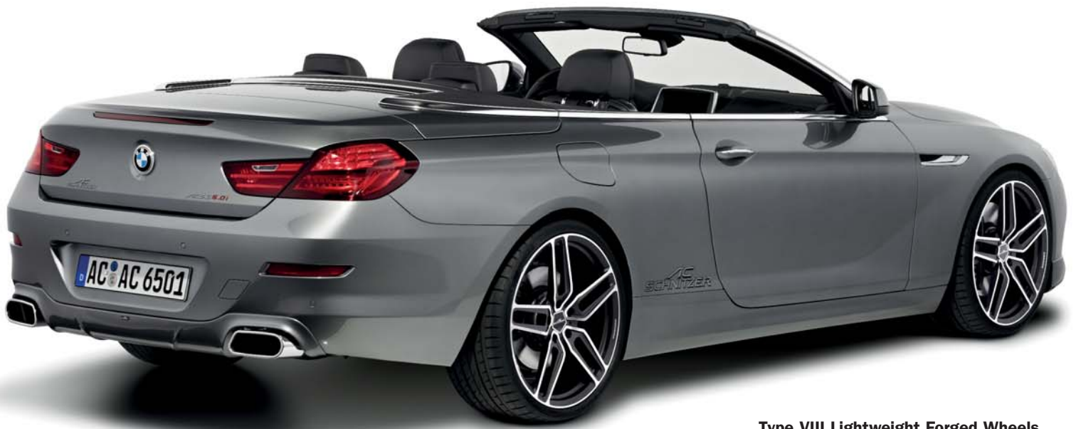
Type VIII Lightweight Forged Wheels