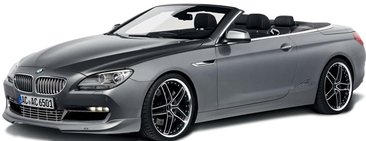
Type VIII Racing Forged Wheels