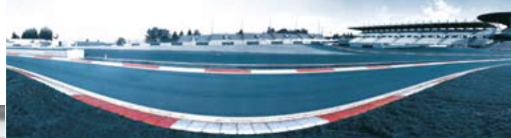
The Nürburgring – known as the „Green Hell“ to motorsport enthusiasts – is also the test track for the Sports Utility Vehicle by AC Schnitzer.